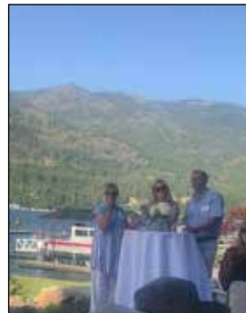
August Lakeside Bingo