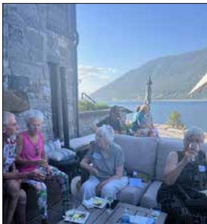
August Lakeside Wine Tasting