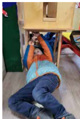
Make believe as a plumber!