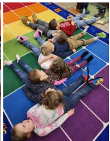
Mathematically organized breaktime.