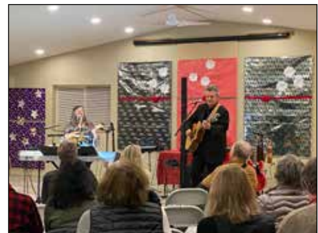
December Xmas Concert with Bridges Home