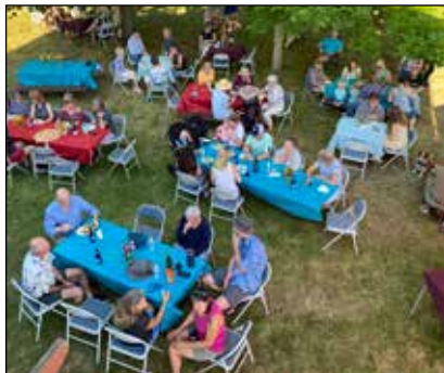
July Music with Just Us band