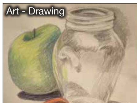
Art - Drawing