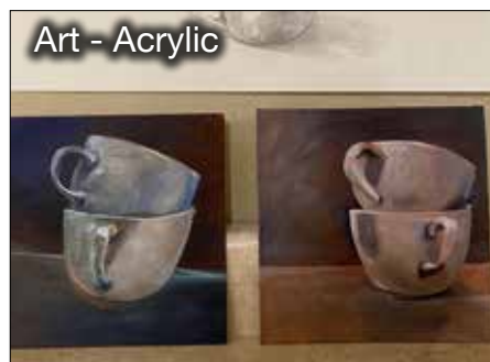
Art - Acrylic