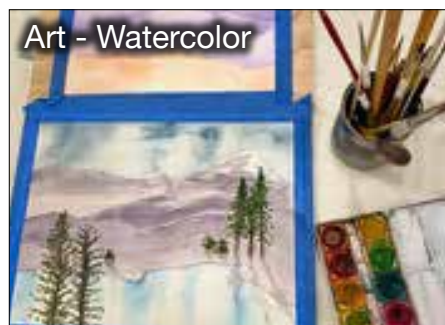
Art - Watercolor