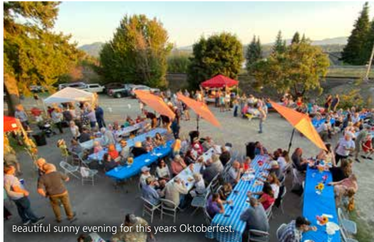
Beautiful sunny evening for this years Oktoberfest.