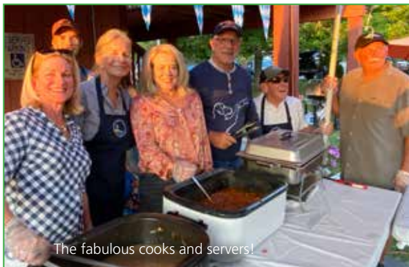
The fabulous cooks and servers!