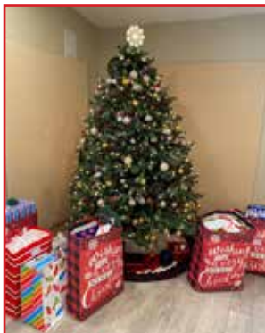
Pam Hewitt Assisted on Pick-up day.