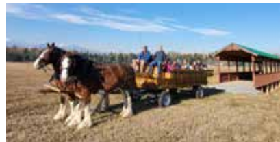
Pix to the left: Preschool trip to Parnell Ranch