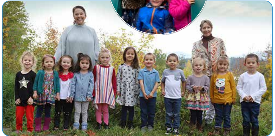
2022 Preschool Book