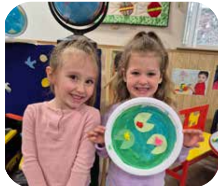
Monet's "Water Lillies" art project

The MCC is accepting preschool applications for the Fall of 2026 School Year.