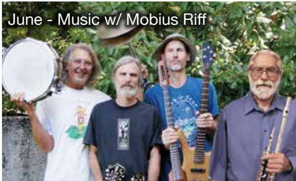
June - Music w/ Mobius Riff