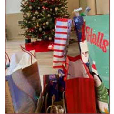
Some pix from MCC's "Christmas Giving" distribution