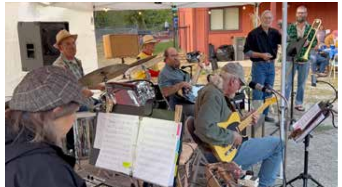
Below: Running With Scissors Band