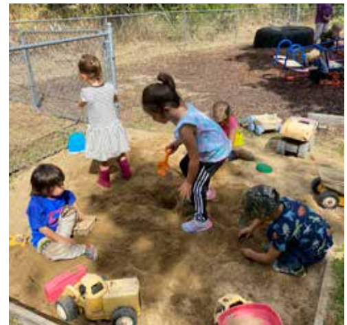
1st day of school: Students enjoy outdoor playtime.