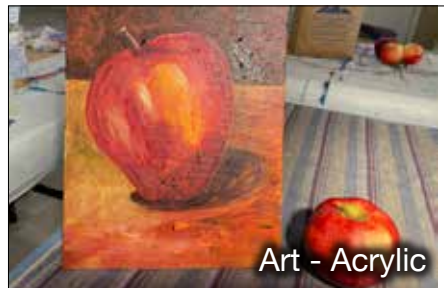
Art - Acrylic