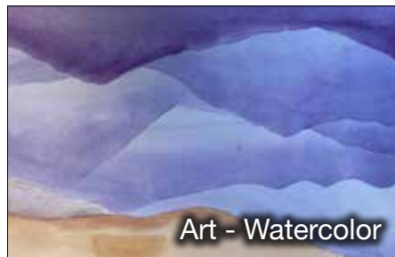
Art - Watercolor