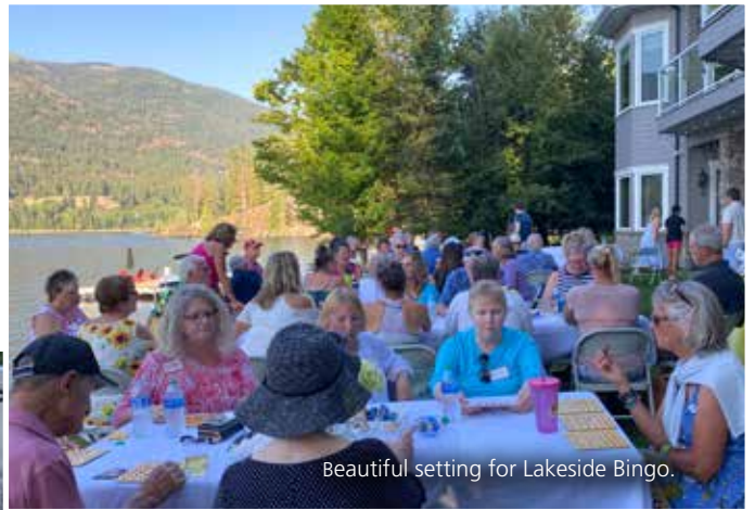
Beautiful setting for Lakeside Bingo.