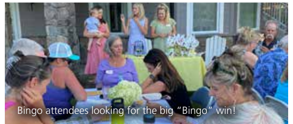
Bingo attendees looking for the big "Bingo" win!