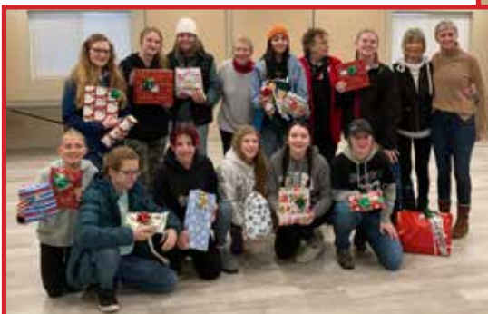
Volunteers for 2021 Christmas Giving wrapping day.

Call our office to volunteer (208-264-5481)