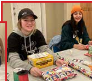
Clark Fork HS Girls Basketball team.